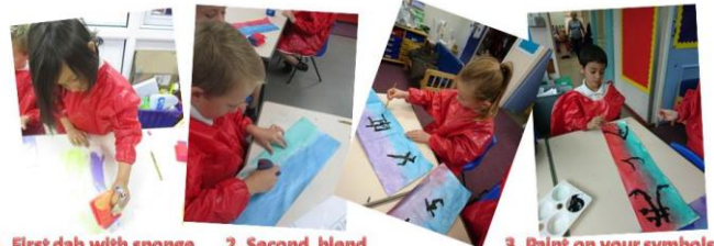
1. First dab with sponge 2. Second, blend 3. Paint on your symbols