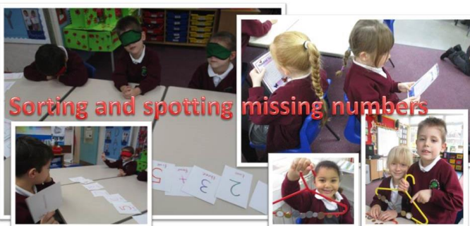
Sorting and spotting missing numbers

We've spent some time exploring number sequences and missing number problems this week using a mix of resources: number lines, 100-squares, number cards, money, and games (of course!)