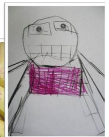
Our favourite outfits